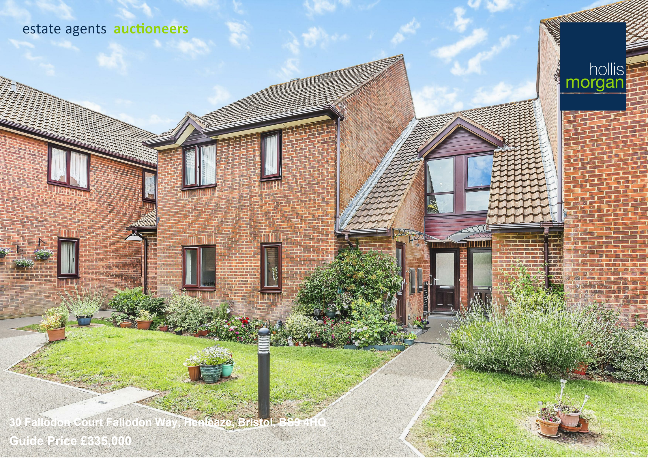
30 Falldon Court Falldon Way, Henleaze, Bristol, BS9 4HQ Guide Price £335,000